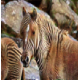
P_{0.5}(w) \rightarrow Q_{12}(w, f)