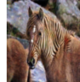
P_{0.5}(w, f) \rightarrow Q_{12}(w, f)