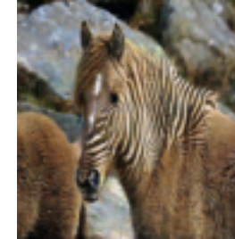
Q_{12}(w, f) \rightarrow P_{0.5}(w, f)